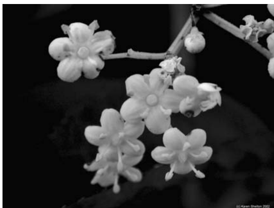
Photo 45. Elder flowers ( Sambucus canadensis ).

possess an inhibitory effect on the motility of larvae (deer lungworm and gastrointestinal nematodes) in vitro, which was independent of the pH of the fluid. 13 Likewise, the sesquiterpene lactones (lacucin and lactucopicrin) demonstrated an antimalarial activity in vitro against Plasmodium falciparum 's strain Honduras-1. 14 Although the overall antimicrobial effect of chicory is considered to be moderate, 15 aqueous, ethanolic, and ethyl acetate extracts of chicory all showed antibacterial activity in vitro, with the ethyl acetate extract having the highest activity. 16