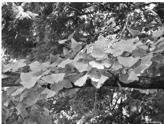
Photo 16. Ginkgo (Ginkgo biloba).

Ginkgo biloba (Photo 16) is a traditional herb for vascular insufficiency, both intracerebral and peripheral. 24 Patients suffering from intermittent claudication were shown by various clinical trials to benefit from using Ginkgo biloba extract, although the overall benefits (e.g., ability to walk on average an extra 35 yards before leg cramps ensue) were modest in nature. 63 An RCT was conducted to investigate a standardized formula of Ginkgo biloba (Egb 761, 160 mg daily) effect in forty-four Himalayan climbers. Compared