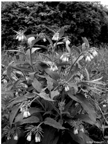
Photo 62. Comfrey ( Symphytum officinale ). Photographer Karen Bergeron, www.altnature.com .