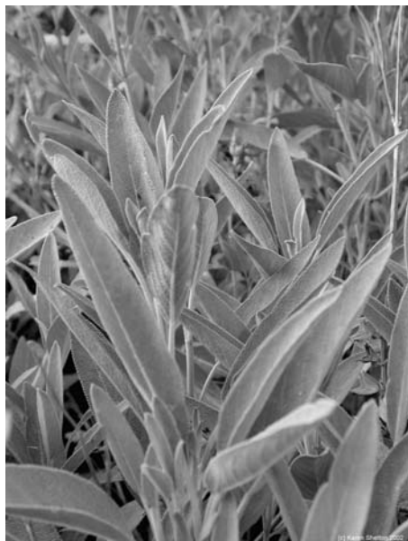
Photo 50. Sage ( Salvia officinalis ).

an antioxidant effect (ginkgo), or for an antiviral effect (garlic and St. John's wort). Because of the potential drug–herb interactions with these herbs, HIV patients must communicate with their physicians prior to initiating treatment with herbal products. In particular, the use of St. John's wort can result in lowering the concentration of antiretroviral drugs to subtherapeutic level due to the herb's ability to potentiate liver enzymes responsible for drug metabolism. Thus, the use of St. John's wort in HIV patients is contraindicated. From clinical studies conducted on the use of herbal products in HIV patients, very little benefits have been observed from traditional Chinese medicine (TCM) herbal products; the TCM product IGM-1 showed some benefits in thirty patients infected with HIV. The TCM herbal product significantly improved the overall quality of life but not the CD4 count (T-cells carrying the marker CD4, whose number is severely reduced in HIV infection), symptom severity, or the anxiety and depression patients experience with this infection. Some combinations of TCM herbal products with antiretroviral medications have resulted in potentiation in the drugs activity. In addition, curcumin use in HIV patients did not increase the CD4 count; nor did it reduce the viral load; and capsaicin use for the relief of peripheral neuropathy, often encountered in patients with HIV infection, was ineffective. 52