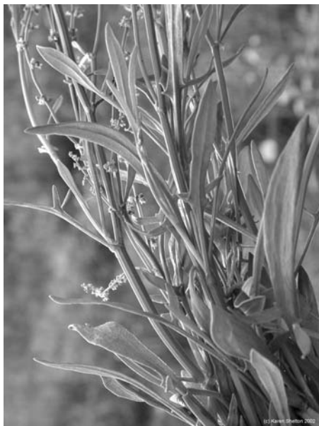
Photo 6. Sheep sorrel ( Rumex acetosella ).