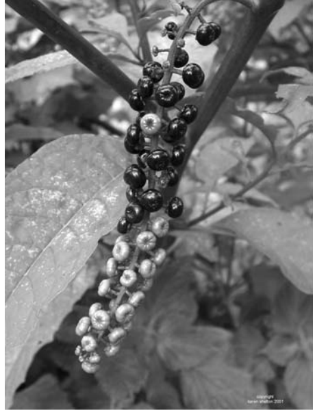
Photo 58. Pokeroot ( Phytolacca americana ).

enzymatic systems responsible for drug metabolism, namely CYP1A2, CYP2D6, and CYP3A4 (in which CYP stands for cytochrome P450, which is a major family of hepatic enzymes), with the CYP3A4 enzymes being the easiest to induce by the herbs. For example, Echinacea purpurea , horse chestnut, and sage demonstrated an inhibitory action against all the three enzyme systems in vitro . 8