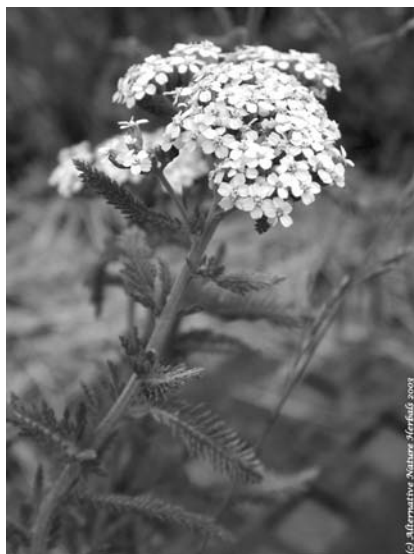
Photo 10. Yarrow ( Achillea millefolium ).

can be important in treating colorectal cancer. Curcumin was shown to have a significant inhibitory and lethal effect on human colon cancer cells grown in culture. 86 In addition to its anti-inflammatory activity, curcumin also exerts an antiangiogenic action. 53 When curcumin was injected intraperitoneally in mice bearing Ehrlich ascites tumor, there was a 66% reduction in ascites fluid as compared to control group. This action was attributed to curcumin's inhibitory effect on vascular endothelial growth factor (VEGF) present in cancer cells. 53