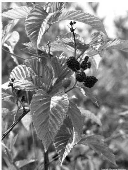
Photo 21. Blackberry ( Rubus fruticosus ).