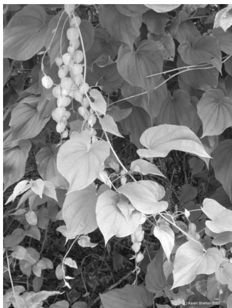
Photo 38. Wild yam ( Dioscorea villosa ).

family Umbelliferae and grows to a height of approximately 6 feet, producing white flowers during June and July. 61 The medicinal parts of the herb are the roots. 61 Despite its use by the public for menopause, clinical data does not support its action for menopausal symptoms. 52,61 And this botanical is mistakenly thought of as containing phytoestrogens; it does not. 52 In the United States patients purchase preparations containing Angelica sinensis as a single herb. However, in traditional Chinese medicine, this herb is commonly prescribed to treat women's conditions in combination with other herbs. 61 At this time, there is no scientific evidence to support its use for the symptoms of menopause.