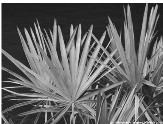
Photo 34. Saw palmetto ( Serenoa serrulata ).

Among the most popular natural remedies for BPH is saw palmetto ( Serenoa repens , Sabal serrulata ) (Photo 34). This botanical has a diuretic effect, enhances the production of sperm, and improves libido. 5 The extract of the dried ripe fruit from the American dwarf palm plant are used for the treatment of BPH. 6 In Europe, natural treatments for BPH are extremely popular. For example, in Italy about 50% of the therapies for BPH are natural products. 6 Even higher usage of natural products has been reported in Germany and Austria, where nine out of ten remedies given for BPH are natural. Self-treatment with botanicals for BPH in the United States was reported in one urologic clinic to be approximately 25%. 6 According to the German Commission E, saw palmetto helps to reduce the symptoms of BPH without affecting the hypertrophy. 7 This is supported by multiple clinical studies conducted in Europe. 8 In double-blind placebo-control studies, saw palmetto extract demonstrated superiority over placebo in relieving the symptoms associated with BPH at doses of 320 mg (160 mg twice daily) over one to three months. 9 The herbal extract significantly improved urinary flow and decreased residual urine and nocturia (excessive nighttime urination). 9 In an open-label study with 505 patients