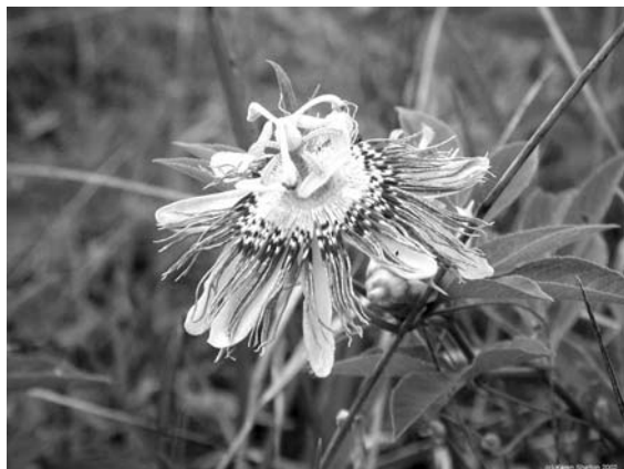
Photo 12. Passionflower ( Passiflora incarnate ).