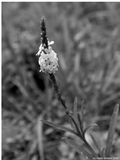
Photo 46. Blue vervain ( Verbena hastata ).