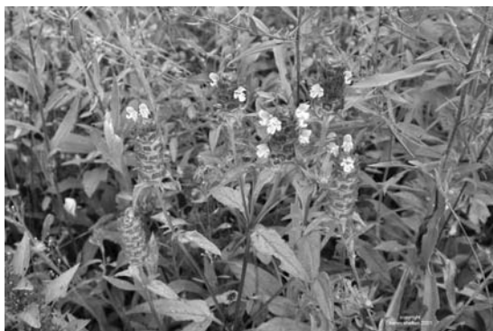
Photo 49. All heal, a Prunella ( Prunella vulgaris ) extract.