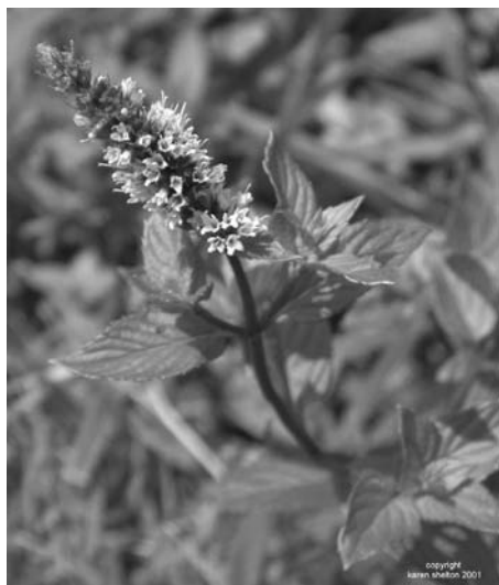
Photo 29. Peppermint ( Mentha piperita ).

in Iberogast appears to provide a more rapid symptoms relief, a matter of importance when pain is present. Other supportive herbs were included in some of these studies, including fennel, wormwood, and ginger (Photo 33). Although peppermint is generally considered safe as a dietary ingredient, some people may be allergic to it and should avoid it. In severer cases, exacerbation of asthma by peppermint has been noted. 1