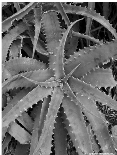
Photo 17. Aloe (Aloe vera).

Azadirachta indica (AI), Sphaeranthus indicus (SI), and Aloe vera (AV) (Photo 17). The most effective herbs tested in this study against ROS were CL, HI, and AI; SI had a weaker effect on ROS. For proinflammatory markers, the most significant effect was seen with AI and SI; three herbs (HI, SI, and CL) demonstrated weaker effect. No activity against ROS or proinflammation was seen with AV. Because of these activities, CL, HI, AI, and SI may play an important role in managing propionibacterium acne.