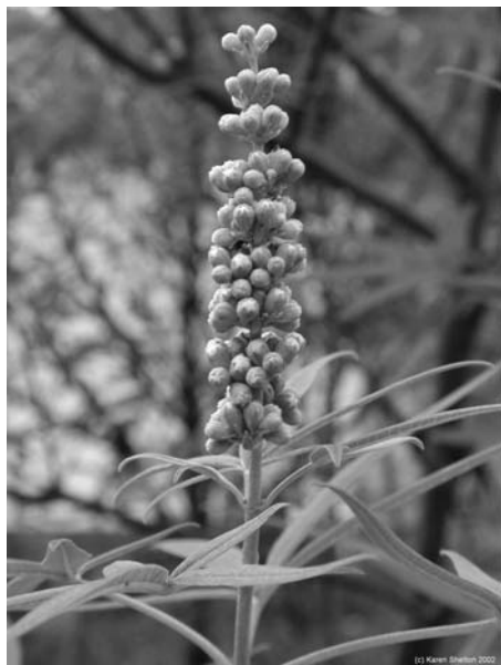
Photo 35. Cheste berry ( Vitex Agnus castus ).

for three to six months for fertility purposes. Another smaller study investigated the effect of Agnus castus extract given in a fifty-drop solution three times daily for three months. 20 Patients with oligomenorrhea (thirty-seven) or amenorrhea (thirty) were randomly assigned to receive the herbal extract or a placebo. The study was double-blind. Only women with oligomenorrhea who received Agnus castus extract had a significantly higher pregnancy rate than the placebo group (82% vs. 45%). Oligomenorrhea patients who took the extract also experienced a significant increase in their progesterone level as compared to the control group. The authors' recommendation was for those with oligomenorrhea, that administering the botanical extract for three to six months could be beneficial in achieving pregnancy.