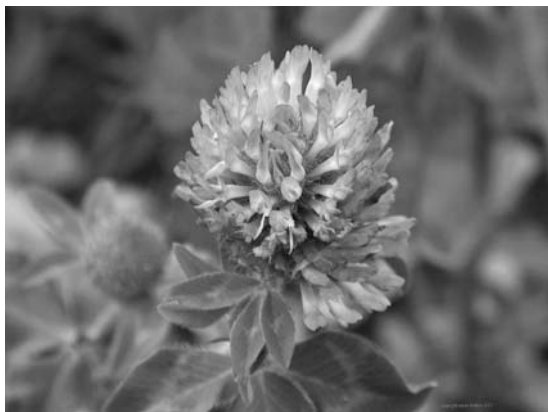
Photo 37. Red clover ( Trifolium pratense ).

ginseng possesses a weak estrogenic effect that is manifested in mastalgia (an increase in breast tissue density) and postmenopausal vaginal bleeding. 56,57 A ginseng cream application on a forty-four-year-old woman caused uterine bleeding. Vaginal bleeding occurred in a seventy-two-year-old woman after taking ginseng tablet. 58 However, some contributed these effects to adulterations in ginseng products. 59 Because P. ginseng is considered a general tonic and revitalizing herb, its use for postmenopausal symptoms could be helpful. However, it should be used with extreme caution, and only under a physician's supervision, due to its ability to increase breast tissue density and cause uterine bleeding. Without proper medical monitoring, this botanical should be avoided during menopause.