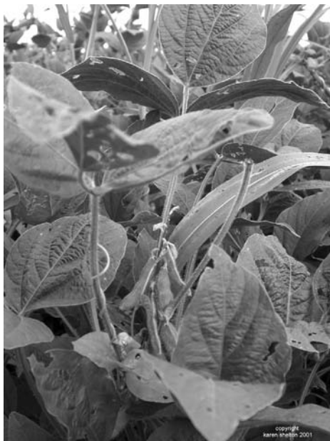
Photo 23. Soy ( Glycine max ).

three doses resulted in a significant reduction in blood glucose concentration when compared to control. Time of dosing before the glucose test was not a contributing factor. 47 American ginseng appears to have an effect on blood glucose in healthy people similar to that observed in diabetic individuals. Panax Ginseng exhibits a glucose-lowering effect in animal studies as well as in clinical