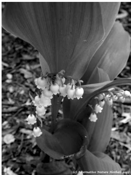
Photo 22. Lily of the valley ( Convallaria majalis ).