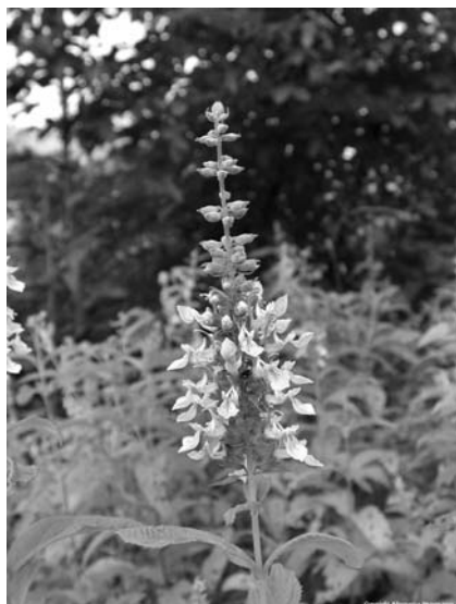
Photo 56. Germander ( Teucrium canadense ).