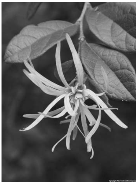
Photo 15. Witch hazel ( Hamamelis virginiana).