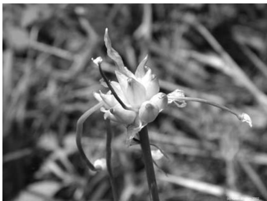
Photo 4. Garlic ( Allium sativum ).

Herbs, in particular, contain various chemicals (known collectively as phytochemicals) that may provide a protective effect against cancer and/or inhibit effect against tumor cells. Doing so expands and adds to the lethality of conventional chemotherapy used against cancer cells. For example, the essential oils of common botanicals in foods and spices can inhibit mevalonate synthesis which is critical for cancer cell survival; 9 the presence of lycopene, a potent scavenger for oxygen free radicals, in tomatoes can help protect against certain types of cancer. 10 There are some indications in scientific/medical literature that certain botanical treatments may be helpful in cancer prevention. These include P. ginseng , garlic (Photo 4), and green tea. Other herbal remedies are still lacking the scientific and medical proofs to fully ascertain their efficacy in cancer treatment (e.g., mistletoe and Essiac). 11 In general, herbs have the ability to enhance phase I and II metabolism and thus help eliminate carcinogens from the body. 12 It is extremely important in this area of therapy to have integrative medicine clinicians working side by side with the cancer specialists to get the best results from the combined drug–herb–CAM therapy.