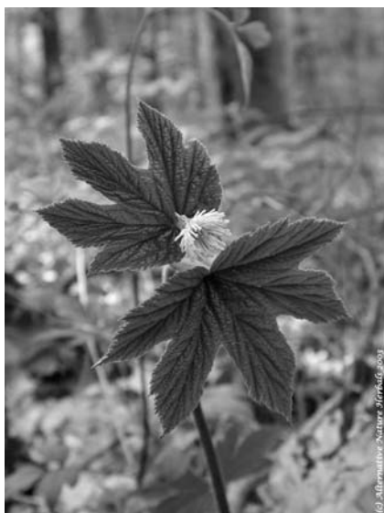
Photo 8. Goldenseal ( Hydratis Canadensis L.).