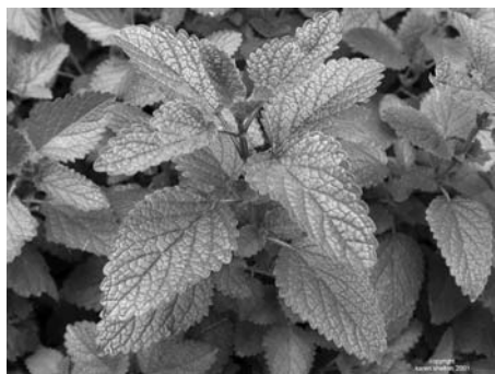
Photo 30. Lemon balm ( Melissa officinalis ).

A study investigating the use of amalaki obtained from the dried fruits of Embllica officinalis in the treatment of dyspepsia found that amalaki was as effective as gel antacids in relieving the dyspepsia symptoms. 1 Musa sapientum or banana was shown to be highly effective in controlling dyspepsia symptoms