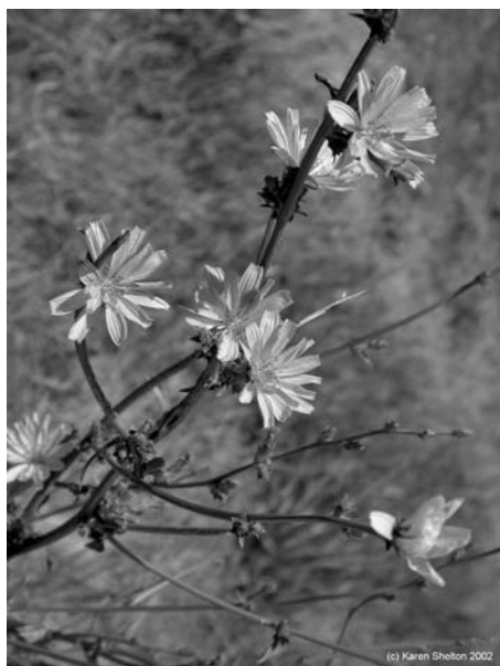
Photo 5. Chicory ( Cichorium intybus ).

Similar to the other plants in the Asteraceae family, chicory roots mainly contain low mean degree of polymerization (DP) inulins. (Their DP = 10–15, approximately 20% of the fresh weight and 80% of the dry weight of the plant's roots.) 17 In addition, the other components found in smaller amounts in it are sesquiterpene lactones (guaianolides, eudesmanolides, and germacranolides), 14 alpha-amyrin, 18 taraxerone, 18 bornyl acetate, 18 beta-sitosterol, 18 and daucosterol. 19 Several acids are also present, including azelaic acid, 19 ferulic acid, 20 caffeic acid derivatives (chicoric acid), 20,21 and tartaric acid. 22 Neoxanthin, violaxanthin, lutein, and beta-carotene exist in minute amounts in the plant (measured in micrograms per gram of plant). 23 In addition, the leaves contain coumarin glucoside ester (cichoriin-6'-p-hydroxyphenylacetate) 24 and a significant amount of phenolic antioxidant compounds. 25