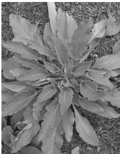
Photo 27. Clary sage ( Salvia sclaria ).