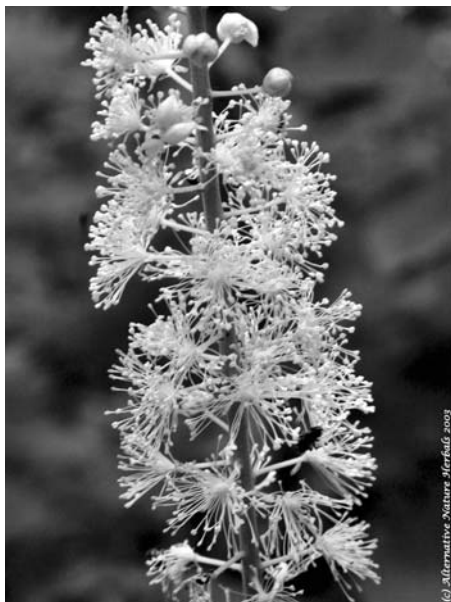
Photo 36. Black cohosh ( Cimicifuga racemosa ).

Moreover, phytoestrogens produce a very weak estrogenic effect that is beneficial during menopause. Black cohosh ( Cimicifuga racemosa ) (Photo 36) is a Native American herb that has been used for woman's health predating the European settlements in the New World. 50 The United States Pharmacopoeia included black cohosh in its 1830 edition under the title black snakeroot. 50 However this herb is no longer recognized in the U.S.P., and according to the U.S. FDA it is an "herb with undefined safety." 51 The roots of Cimicifuga racemosa contain cimicifugoside (cycloartenol-type triterpenoids), 50 several organic acids such as ferulic, isoferulic, and piscidic (cinnamic acid derivatives), 50 and tannins 51 such as biochanin (an isoflavone). 52 There is also a controversy over the presence of an estrogenic isoflavone in the roots, namely formononetin, and most data indicate that this chemical is not present in any significant amount, if at all, in the roots. 52 In clinical studies, the most used form of black cohosh is Remifemin (manufactured by GlaxoSmithKline), an extract from the herb's roots. 52 It should be noted however that Remifemin's formula has been changed over the years, and different clinical studies may have used varying formula reported under the same name. 52