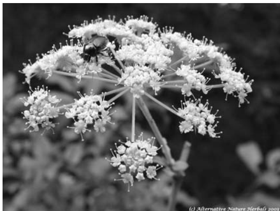
Photo 31. Angelica ( Angelica atropurpurea ).

in a small clinical study (forty-six patients with nonulcer dyspepsia) conducted in India. In patients who received banana powder, 75% of them experienced relief of symptoms, compared to only 20% of those in the placebo group. People who are allergic to banana should obviously avoid its use. In India people use turmeric ( Curcuma longa ) for indigestion. 1 Two essential oils are found in turmeric, turmerone and zingiberene. 2 Both oils possess antispasmodic effects as well as act as carminative, improving digestion. 1,2 In a small clinical study (116 patients) conducted in Thailand, the consumption of turmeric (2 g per day) for one week was superior to placebo in controlling the symptoms of dyspepsia. The major side effects reported in turmeric consumption were sleepiness/tiredness, headache, nausea, and diarrhea. Greater celandine