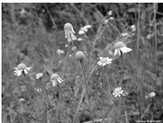
Photo 32. Chamomile ( Matricaria sp.)

in a small clinical study (forty-six patients with nonulcer dyspepsia) conducted in India. In patients who received banana powder, 75% of them experienced relief of symptoms, compared to only 20% of those in the placebo group. People who are allergic to banana should obviously avoid its use. In India people use turmeric ( Curcuma longa ) for indigestion. 1 Two essential oils are found in turmeric, turmerone and zingiberene. 2 Both oils possess antispasmodic effects as well as act as carminative, improving digestion. 1,2 In a small clinical study (116 patients) conducted in Thailand, the consumption of turmeric (2 g per day) for one week was superior to placebo in controlling the symptoms of dyspepsia. The major side effects reported in turmeric consumption were sleepiness/tiredness, headache, nausea, and diarrhea. Greater celandine