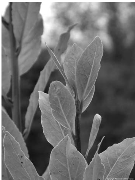
Photo 25. Sweet bay ( Laurus nobilis ).