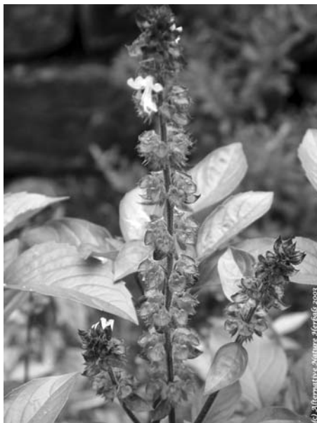
Photo 43. Holy basil ( Ocimum sanctum ).

organs (kidney, liver, etc.) and lethargy, the occurrence of these signs in mice treated with the Schizandrae fructus extract was rare. 11