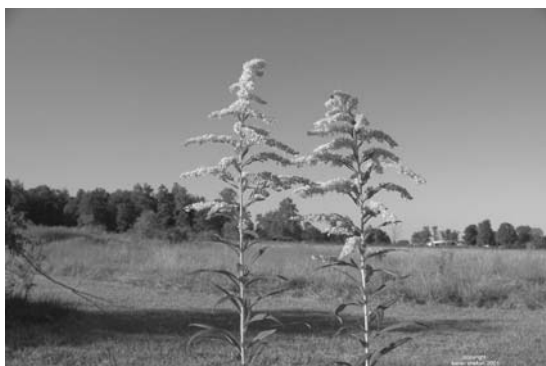
Photo 55. Goldenrod ( Hydrastis canadensis ).

and a combination of aspen, ash, and goldenrod (Photo 55). 6 In treating of rheumatoid arthritis cat's claw ( Uncaria tomentosa ) and the Chinese herb lei gong teng ( Tripterygium wilfordii Hook F) were found efficacious, and stinging nettle ( Urtica dioica ) and willow bark ( Salix alba ) demonstrated activity against osteoarthritis. 7 It was thought that lei gong teng acted by blocking the