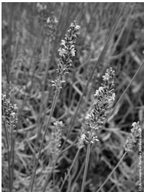
Photo 11. Lavender ( Lavendula officinalis ).

symptoms of hot flashes and night sweats. In managing the menopausal symptoms herbal remedies along with vitamin intake and cognitive behavioral therapy were the reported modalities women preferred in managing their symptoms. 89 Insomnia is often seen in cancer patients. The use of herbal remedies such as hops, lemon balm, Lavender (Photo 11), passionflower (Photo 12), and chamomile can help to induce mild sedation when insomnia ensues. 90