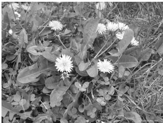
Photo 48. Dandelion ( Taraxacum officinalis ).

(4–10 g tid), fluid extract (1:1, one–two teaspoons tid), tincture (1:5, one–two teaspoons tid), or juice (one–two teaspoons tid). 42