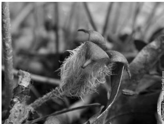
Photo 33. Ginger ( Zingiber officinalis ).

( Chelidonium majus ) is another herb with antispasmodic action. However, this herb is highly toxic to the liver and can cause damage that may be reversible upon discontinuation of the herb. 1 Greater celandine is an ingredient in Iberogast and with known reported liver damage found in literature or the manufacturer's product information. It is perhaps this specific amount of greater celandine in the formulation that does not lead to toxic effect on the liver.