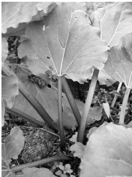
Photo 42. Rhubarb ( Rheum sp.).

to the plant antibacterial agent is that the gram-negative bacteria has an outer protective wall surrounding the cell, combined with a pumping mechanism by which it keeps exogenous substances outside the cell. Thus, antibacterial plant compounds such as rhein from rhubarb (Photo 42), resveratrol from grapes, or berberine from goldenseal (which has been used extensively in the treatment of diarrhea and is found in many plants of the Ranunculaceae, Berberidaceae, and Menispermaceae families) 3 were shown to have a greater antibacterial effectiveness on gram-negative bacteria, when they were given with substances to disable the pumping mechanism of the bacterial cell. 4