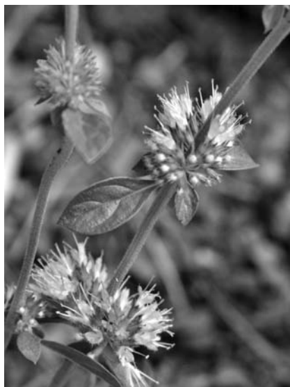
Photo 57. European pennyroyal ( Mentha pulegium ).

belladonna ( Atropa belladonna ), chaparral ( Larrea tridentata ), coltsfoot ( Tussilago farfara ), comfrey ( Symphytum ), ephedra ( Ephedra sinica ), European mistletoe ( Viscum album ), germander ( Teucrium chamaedrys ) (Photo 56), licorice ( Glycyrrhiza glabra ), life root ( Senecio aureus ), Pennyroyal ( Hedoma pulegioides ) (Photo 57), pokeweed ( Phytolacca americana ) (Photo 58), sassafras ( Sassafras albidum ) (Photo 59), Indian snakeroot ( Rauvolfia serpentina ), tea tree ( Malaleuca alternifolia ) oil, and yohimbe ( Pausinystalia yohimbe ). 5 Many of the safety issues arise when the botanical is taken internally when it is intended for external use only (e.g., arnica), taken chronically over a prolonged period of time and/or in large doses (e.g., licorice), or contains toxic substances (e.g., comfrey). 5 The ingestion of some of these troublesome herbs (e.g., poke-weed, pennyroyal oil, chaparral, germander, and comfrey) has even resulted in death. 6