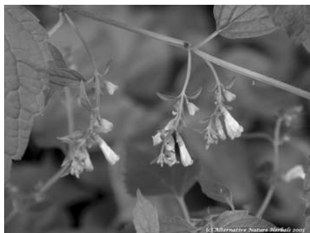
Photo 61. Skullcap ( Scutellaria lateriflora ).

Throughout this book, issues concerning herbal safety have been introduced. The reader is encouraged to refer to them as needed. This chapter will add more information on this important subject when it comes to dietary supplement use.