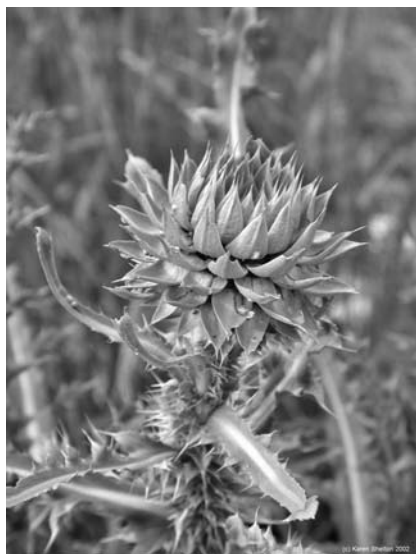
Photo 9. Milk thistle ( Silybum marianum ).