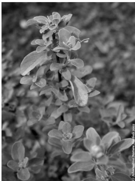
Photo 44. Sweet marjoram ( Origanum majorana L.).

Petroleum ether extracts obtained from chicory were tested against fungi growth in vitro. The extracts showed antimycotic activity, as it inhibited spore germination. 12 The sesquiterpene lactones present in chicory were found to