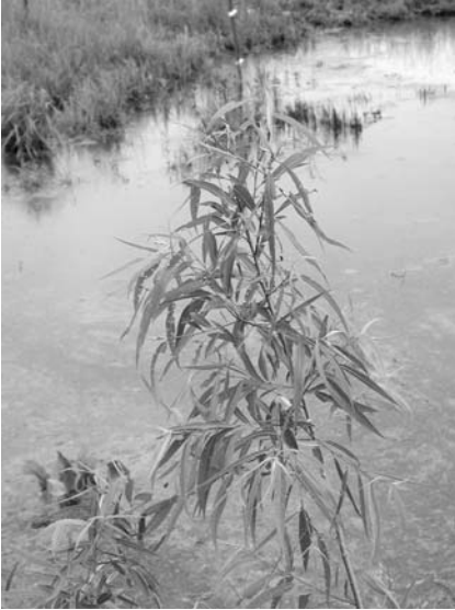
Photo 51. Willow bark ( Salix sp.).