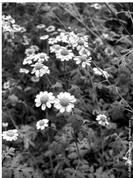
Photo 41. Feverfew ( Chrysanthemum parthenium ).

taken while driving or operating machinery. 15,26 In vitro data, but not in vivo experiments, have shown potential cytotoxicity and mutagenicity for valerian's components. Pregnant women should not be given Valerian unless prescribed by a physician. 15 St. John's wort, an herb used for the management of mild to moderate depression, can also help with insomnia through its effect on GABA receptors. Components of St. John's wort can bind to GABA receptors to elicit a calming and relaxing response. 4 It should be also emphasized that botanicals that act on GABA receptors, such as valerian and St. John's wort, have the potential to have an additive effect with barbiturates and benzodiazepines. 4