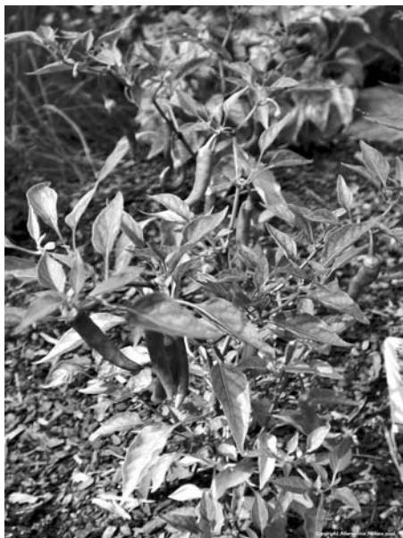
Photo 19. Cayenne ( Capsicum annuum ).

neurogenic inflammation (i.e., neurologic in its origin) at low doses of capsaicin (0.125 and 0.25 microgram/cm 2 ) and caused erythema at higher doses (0.5 to 4 micrograms/cm 2 ). 56