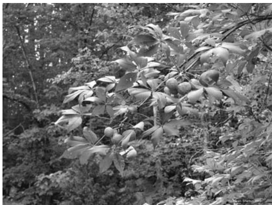
Photo 14. Horse chestnut ( Aesculus hippocastanum ).