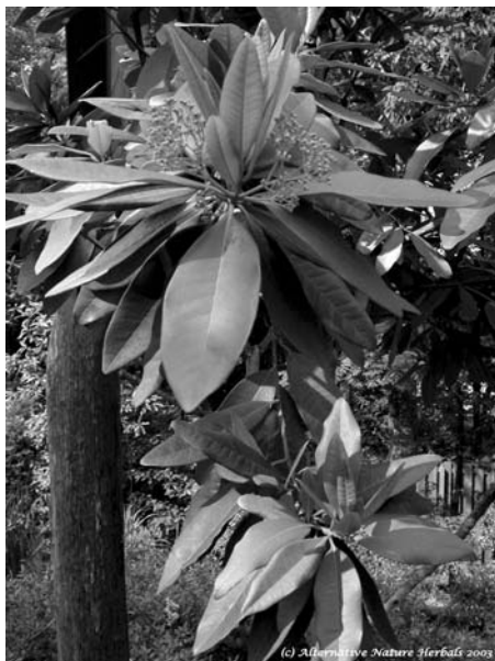
Photo 20. Cinnamon tree ( Cinnamomum burmannii ).

However, their effectiveness has been documented only by in vitro data, and their clinical applications in patients thus far have been disappointing. 2 Interestingly, some claim that the antidiabetic activity of botanicals might be related to their content in trace metals. The seeds of Eugenia jambolana , an herb from India, were tested for the activity of their inorganic matter in a diabetic rat model. Having burned into ash, the residue from burned seeds contained chromium, potassium, sodium, zinc, and vanadium. When given to diabetic rats, the inorganic matter demonstrated a remarkable normalizing effect on the blood glucose concentration. 3