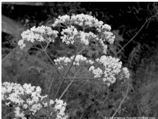
Photo 40. Valerian ( Valeriana officinallis ).

Two of the symptoms of menopause are sleep disturbances (mainly insomnia), anxiety, and mild to moderate depression. As was mentioned above, the licorice components glabridin and glabrene possess estrogenic activity. Both components were also found in vitro to inhibit serotonin reuptake in HEK 293 cell line that expresses human serotonin transporter. Due to this inhibition of serotonin reuptake, licorice root extract containing glabridin and glabrene may help with the symptoms associated with menopausal depression. 83