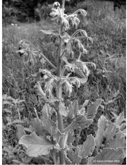
Photo 52. Borage ( Borago officinalis ).