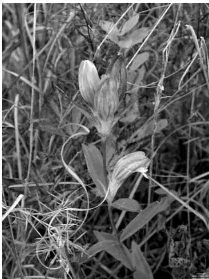
Photo 47. Gentian ( Gentiana saponaria).