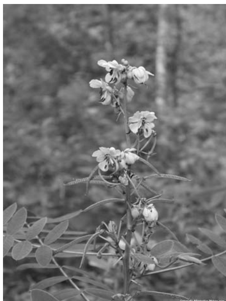
Photo 60. Wild senna ( Senna marilandica ).

group are cascara sagrada ( Rhamnus purshiana ), celandine ( Chelidonium majus ), chaparral ( Larrea tridentata ), kava ( Piper methysticum ), ephedra ( Ephedra sinica ), pennyroyal ( Mentha pulegium ), senna ( Cassia senna ) (Photo 60), skullcap ( Scutellaria lateriflora ) (Photo 61), and comfrey ( Symphytum officinalis ) (Photo 62). 9