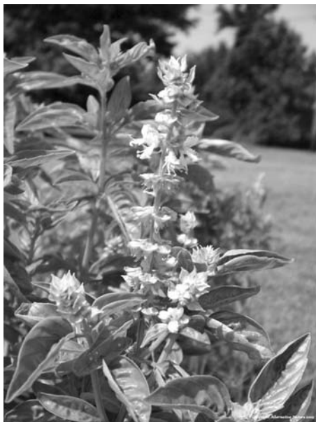
Photo 13. Sweet basil ( Ocimum basilicum ).

Essential (volatile) oils are common components in the plant kingdom. These oils are obtained from plants in their concentrated forms and should never be used unless diluted. Normally, essential oils are diluted with fixed oils (e.g., olive oil), so that they do not cause damage to the tissues with which they come in direct contact. Examples include oils obtained from lavender, fir, basil (Photo 13), eucalyptus, pine ( Pinus pinaster ), and rosemary. When administered, these oils can cause a reduction in lipid peroxidation, indicative of their effect as antioxidants. 18 For example, rosemary oil was shown to protect against lipid peroxidation and increase the level of natural antioxidant compounds (e.g., glutathione) in mice exposed to radiation. 19 Pine seed oil was found to reduce the level of plasma total cholesterol and VLDL in mice; however, it does not alter the status of atherosclerotic plaques. 20