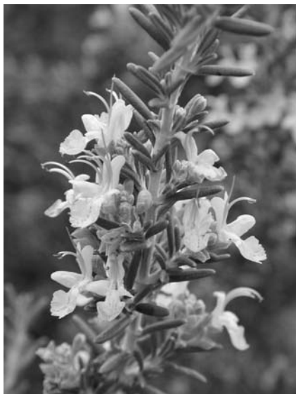
Photo 26. Rosemary ( Rosemarinus officinalis).