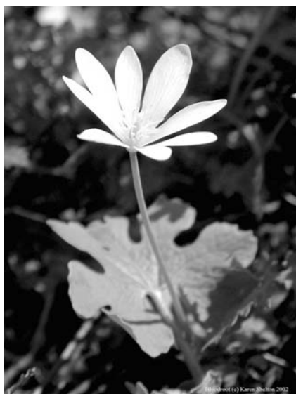
Photo 7. Bloodroot ( Sanguinaria Canadensis ).

Berberine is an isoquinoline quaternary ammonium alkaloid found in many plants of the Berberidaceae and Menispermaceae families. 81 It is usually isolated from goldenseal ( Hydratis Canadensis L.) (Photo 8) of the family Ranunculaceae of which many plants contain berberine. 81,82 In traditional