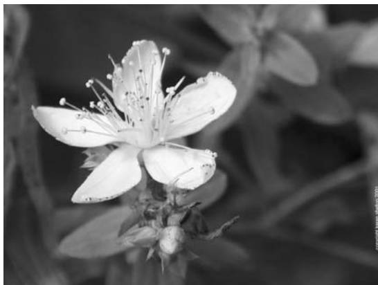
Photo 2. St. John's Wort ( Hypericum perforatum L.).

they are receiving from the various media sources. A responsible manufacturer would also include on the label “standardization” information such as “Standardized to contain: 0.3% hypericin.” These standardization statements assure the consumer that some type of quality control testing is being done on the product to standardize it. The “0.3% hypericin” indicates that dosage units inside the product contain this concentration of the ingredient hypericin (one of active constituents in St. John's wort). Hypericin in this junction functions as a chemical “surrogate” for the other chemicals in the dosage units to assure reproducibility and consistency from one batch to another.