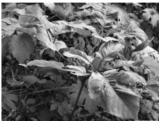
Photo 24. American ginseng ( Panax quinquefolius L.).

three doses resulted in a significant reduction in blood glucose concentration when compared to control. Time of dosing before the glucose test was not a contributing factor. 47 American ginseng appears to have an effect on blood glucose in healthy people similar to that observed in diabetic individuals. Panax Ginseng exhibits a glucose-lowering effect in animal studies as well as in clinical