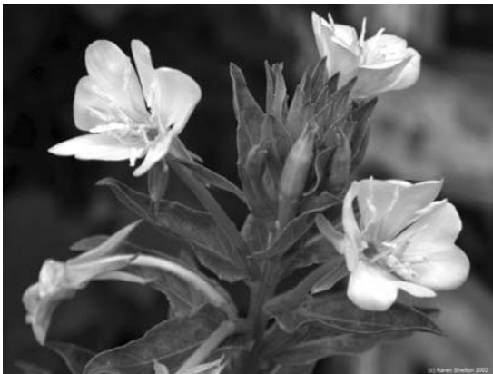
Photo 53. Evening primrose ( Oenothera biennis ).

Rheumatoid arthritis and osteoarthritis inflict many people of both sexes. A host of botanicals have been utilized to combat rheumatic diseases. The list includes blackcurrant seed oil and leaf, borage (Photo 52) oil, devil's claw, evening primrose (Photo 53) oil, nettles (Photo 54) root, willow bark,