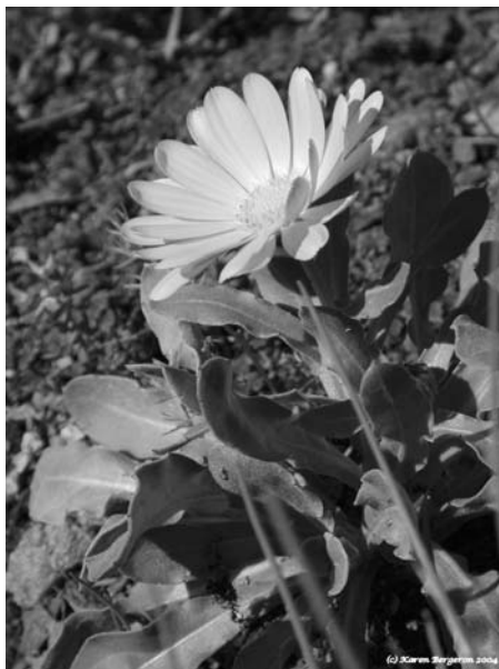
Photo 18. Calendula ( Calendula officinalis ).