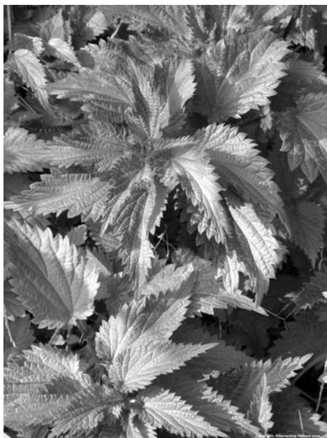
Photo 54. Nettles ( Urtica dioica ).

and a combination of aspen, ash, and goldenrod (Photo 55). 6 In treating of rheumatoid arthritis cat's claw ( Uncaria tomentosa ) and the Chinese herb lei gong teng ( Tripterygium wilfordii Hook F) were found efficacious, and stinging nettle ( Urtica dioica ) and willow bark ( Salix alba ) demonstrated activity against osteoarthritis. 7 It was thought that lei gong teng acted by blocking the