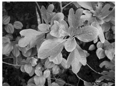
Photo 59. Sassafras ( Sassafras albidum).

Another important group of botanicals with regard to adverse events is that with a potential deteriorating effect on the liver, the major organ for drug metabolism and detoxification in the body. Some of the botanicals in this