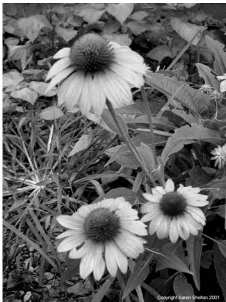
Photo 3. Coneflower ( Echinacea purpurea ).

Unfortunately, not all products on the market meet the U.S.P. standards. In fact, many products do not meet any standard! In a study published in 2003 in the Archives of Internal Medicine on echinacea (Photo 3) products available in a Denver area in August 2000 the authors found 10% of the preparations purchased from retail stores did not contain any echinacea. 9 Since echinacea exists in three different species E. angustifolia , E. pallida , and E. purpurea , with the last two being the active ones, the type of the species in the product becomes important. The study showed that in about half of the products, the label did not match the echinacea species found within the