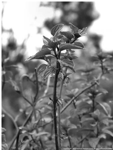
Photo 28. Chocolate mint ( Mentha sp.). Photographer Karen Bergeron, www.altnature.com .

rosmarinic acid, resveratrol, catechol, protocatechuic acid, and quercetin. 55 Botanical extracts that exhibited the strongest inhibition of the enzyme were Myrtus communis and oregano, while the strongest inhibitory action from the isolated components was detected from catechins and caffeic acid. 55 Among the catechins found in green tea is epigallocatechin gallate (EGCG). It was shown to exert a potential glucose-lowering effect in experimental animals. The main mechanism of action of EGCG on blood glucose level is via a decrease in glucose production in the liver; EGCG also acts in ways similar to that of insulin in the phosphorylation reactions of several key enzymatic systems responsible for cellular glucose regulation. 56