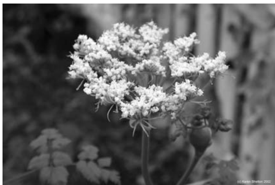
Photo 39. Dong Quai ( Angelica sinensis).

are premenopausal. However, it was found from the Women's Health Initiative's clinical study that the risk of estrogen therapy outweighs its benefits with respect to protecting the heart. 66 Licorice roots contain glabridin, which is an isoflavan, and glabrene which is an isoflavene. Animal experiments and cell culture studies showed that glabridin acts as a partial agonist/antagonist agent of estradiol-17beta. Both compounds of licorice have estrogenic effect. Because of this estrogenic activity of licorice components, the herb has the potential to exert cardiovascular protection during menopause. 66