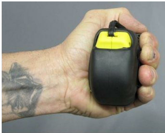
Strike with Edge of Tape

The second way is by turning the tape in your hand slightly and striking with the edge. Here your force will be more concentrated than striking with the wider side. The first example is more like striking with a punch. The second example is more like a knuckle punch where the force is concentrated into a smaller area. This is more likely to break bones and cause a knockout.