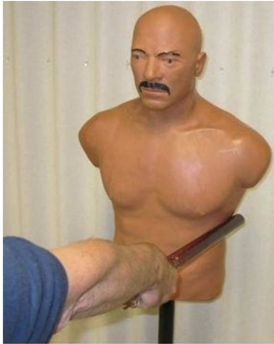
Strong Side Horizontal

The backhand horizontal comes in from your weak side. Think of a backhand in tennis.