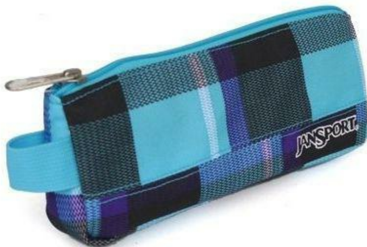
JanSport Pencil Case JTMS9

What is this item? It's an adult pencil case. JanSport makes a model JTMS9, which is basically a zippered case. It is 9 x 22 x 3.5 centimeters. Hanging from your belt it will look like a glasses case. Load that sucker up with coins or anything heavy. You'll look like a pansy but you'll hit like a brick.