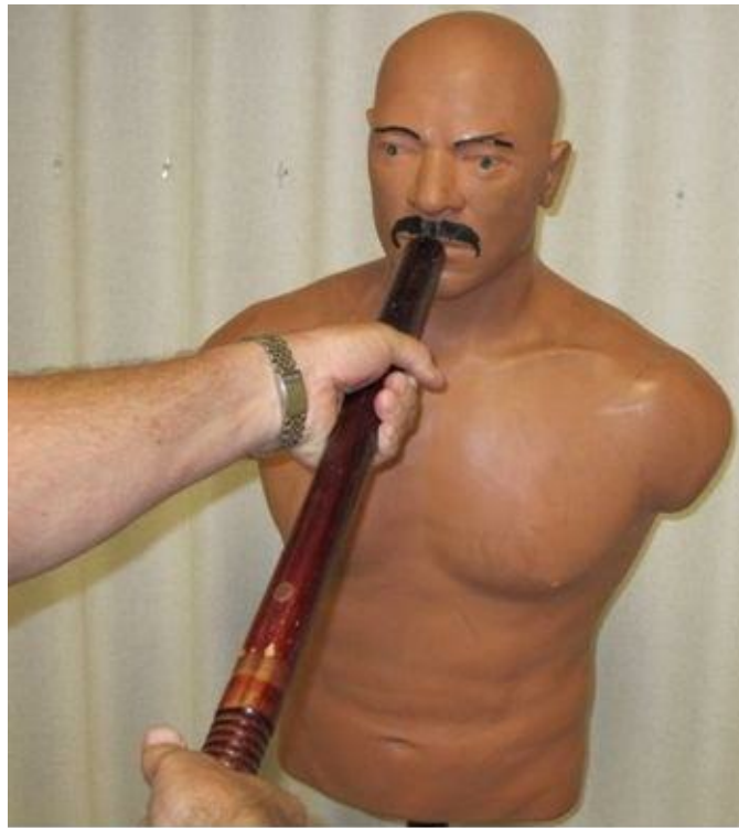
Thrust – Bayonet Grip

The cross body is also delivered with a two-handed bayonet grip, but instead of striking with the tip, you are striking with the bar, more of the style of a hockey player delivering a cross check.