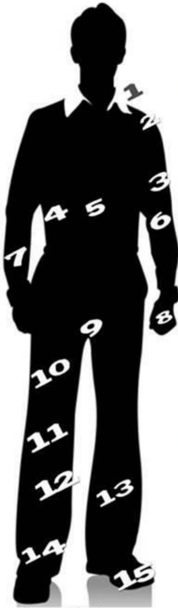
Front of Body