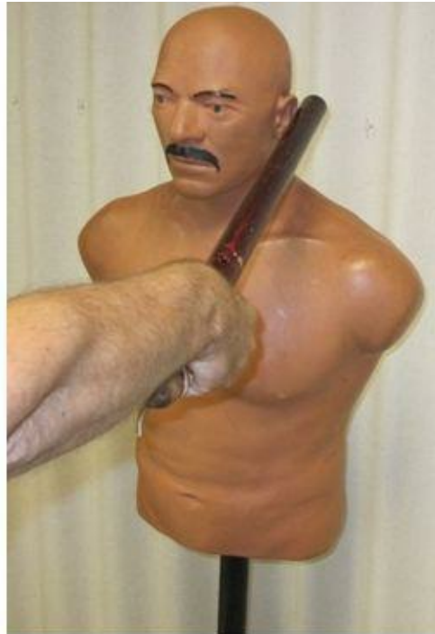
Strong Side Downward Diagonal

The backhand downward diagonal strike is similar only this starts on from your weak side or backhand.