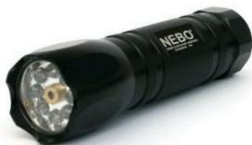
NEBO Model 5077