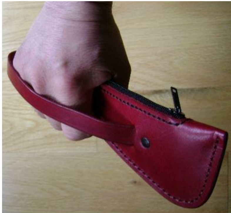
Todd Foster Coin Sap