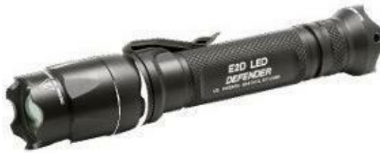
SureFire E2D LED Defender

If you think $150 is a bit much for a tactical flashlight, you've got some cheaper options. Streamlight makes quality flashlights. They've also entered the world of tactical flashlights for civilian use. Streamlight ProTac 2L Professional Tactical puts out 180 lumens on high and has high, low and strobe modes. Press once and you've got high beam, which you want for a tactical light, in my opinion. If you are going to use it for distracting or blinding, you want the first light that comes on to be the high beam. This one runs in the $50 range.