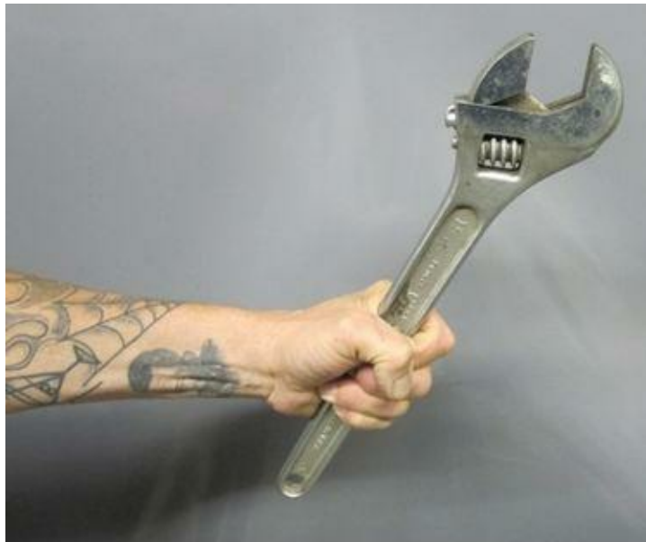
One Hand Hammer Grip

One Hand Hammer Grip: Just what the name implies. Grab it just like you are going to pound nails with a hammer. Ideally you'll want to "choke up" and leave one hand grip length exposed on the bottom. You'll use that end, the pommel, for additional strikes, hooks and blocks. With this grip you'll be able to use the tip and bar for strikes, as well as the pommel to give you more options. Watch a hockey player as he goes into the corner after a puck. He'll use the "butt end" (pommel) of his stick, to jab the opposing player. The penalty is called "butt ending." It's a dirty trick, but it works.