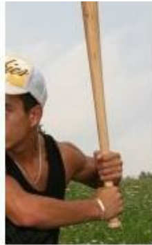
Baseball Bat Grip

Two Hand Double Force Grip: In this grip, your support hand reinforces your strong hand wrist. This is well suited for short and medium length weapons where you can deliver maximum power.