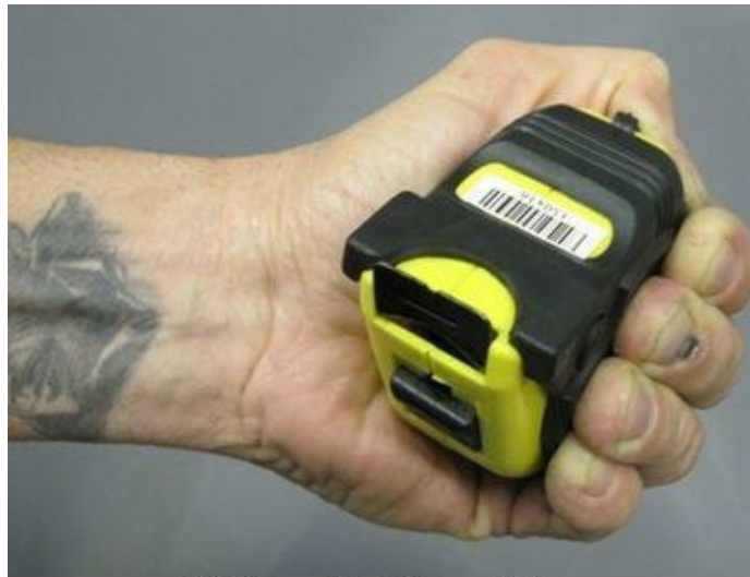
Strike with Sharp Edge