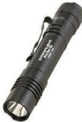
Streamlight ProTac 2L Professional Tactical

If you think $150 is a bit much for a tactical flashlight, you've got some cheaper options. Streamlight makes quality flashlights. They've also entered the world of tactical flashlights for civilian use. Streamlight ProTac 2L Professional Tactical puts out 180 lumens on high and has high, low and strobe modes. Press once and you've got high beam, which you want for a tactical light, in my opinion. If you are going to use it for distracting or blinding, you want the first light that comes on to be the high beam. This one runs in the $50 range.