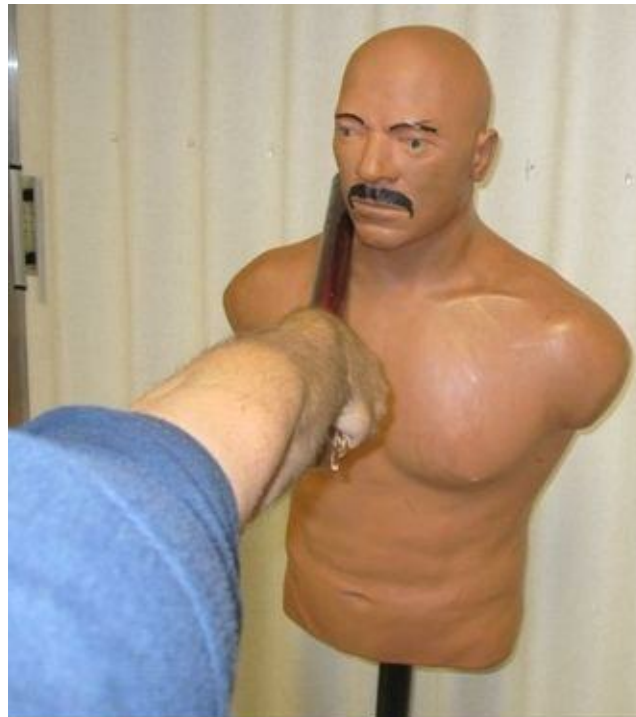
Backhand Downward Diagonal

The backhand downward diagonal strike is similar only this starts on from your weak side or backhand.