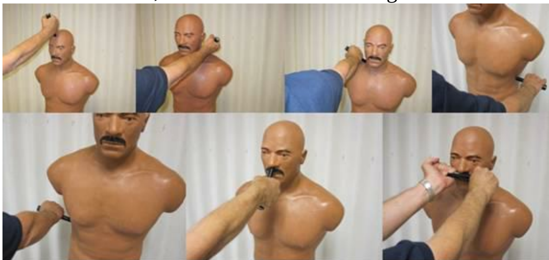
Angles Shown Using Short Impact Weapon

used with a short Yawara, in this case a mini-flashlight.