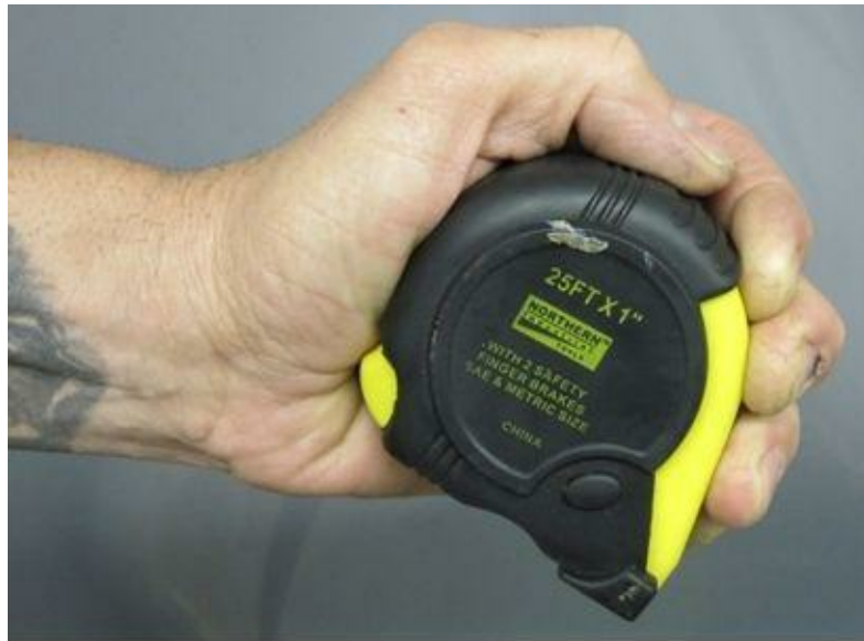
Strike with Flat Side of Tape

The second way is by turning the tape in your hand slightly and striking with the edge. Here your force will be more concentrated than striking with the wider side. The first example is more like striking with a punch. The second example is more like a knuckle punch where the force is concentrated into a smaller area. This is more likely to break bones and cause a knockout.