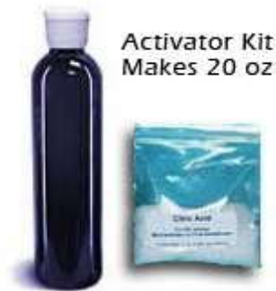
Citric Acid Activator Kits