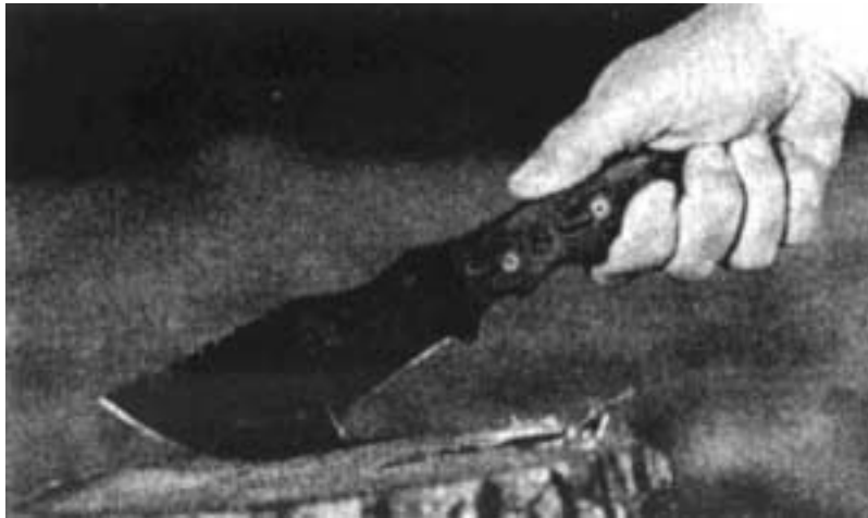
Hand position 3

To increase striking power even more, change hand to position three. This increases leverage for heavier chopping, but may not be as comfortable for extended periods of chopping as position two.