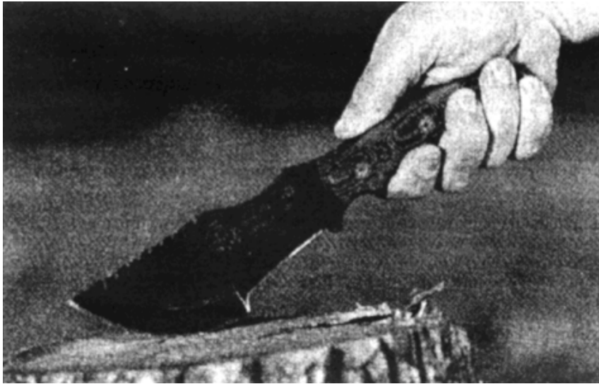
Hand position 2

To increase striking power even more, change hand to position three. This increases leverage for heavier chopping, but may not be as comfortable for extended periods of chopping as position two.