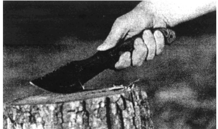
Hand position 1

The key to effective chopping is leverage. The Tracker Knife has a three position handle that allows the user to vary the amount of leverage on the axe. With the hand in position one, the user can do light chopping chores.